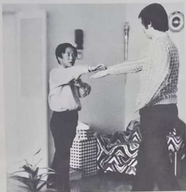
Gen. Choi, Hong Hi, left.