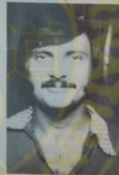
Bacn Wauhegau Illinois